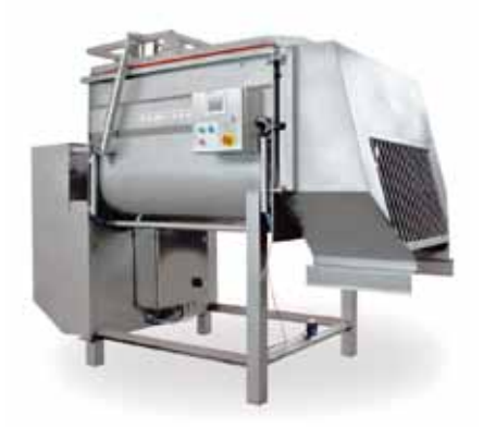
Twin Shaft Mixer series, TSM