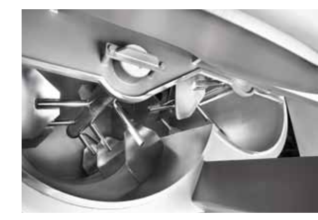
Discharge section of a TSMI

Please note that the scansteel foodtech TSMI Intermeshing Mixer and Mixer/ Grinder programmes are equipped with 2 (two) mixing wing directions: