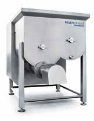
Twin Shaft Mixer/Grinder, Intermeshing series, TSMIG