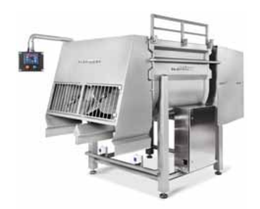
Twin Shaft Mixer series, TSMI